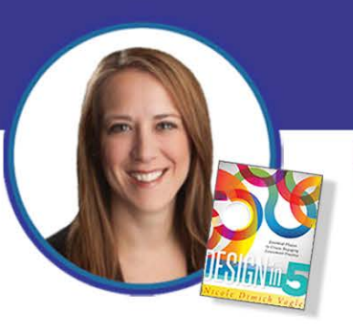
Angela Freese Design in Five Oct 15 or 16